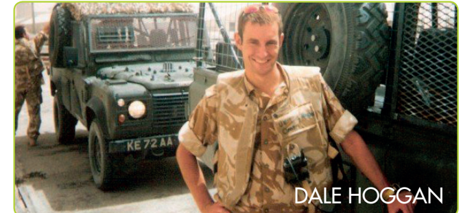
NVQ Assessor/CPCS Tester for Ainscough Training Services Former Royal Logistics Corp

All I can say is the lifting industry is definitely worth looking at for your next career, the opportunities for work and the salaries are there in such a wide range of industries not just construction.