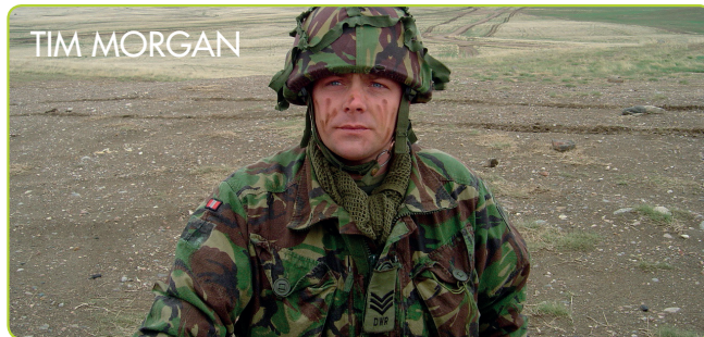
Operations Manager for Ainscough Training Services Former Infantry SNCO, The Duke of Wellington's Regiment

I left the Army in 2006 after 22 years service. The transition to the civilian life was fairly untroubled for me. I believe the main reason for this is knowing what you want to do as a second career and having the attitude and determination to achieve this.